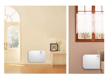
Easy to install, fits within any interior design.